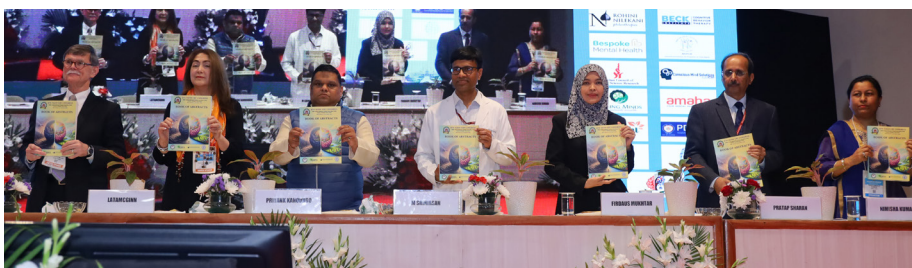
The congress abstract book is unveiled at the opening event

The scientific programme included 12 keynotes, 27 invited talks, 10 skill classes, 18 workshops, 6 invited symposium, 3 invited panel discussions, open papers and poster sessions. Two awards for the Best Doctoral Research from Asia and Distinguished Researcher from Asia were announced for the first time by the IACBT and were generously sponsored by the Beck Institute