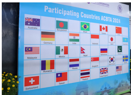
750 delegates from 30 different countries